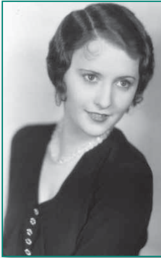
Portrait of Barbara Stanwyck in "Ten Cents a Dance" New Fillmore Theatre"

While many universities have special collections, very few have collections as extensive and significant as the AHC. The AHC does much to support UW's