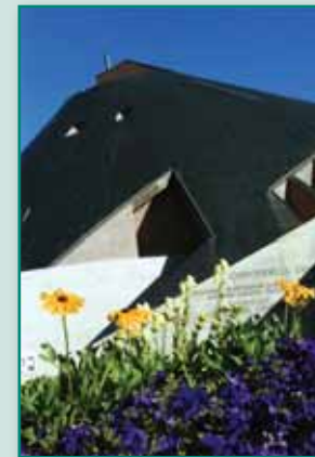
American Heritage Center