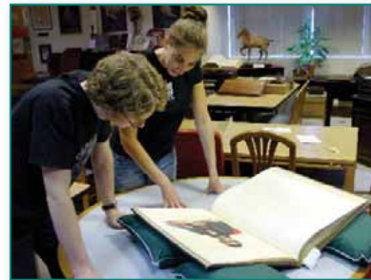
Scholars learning from original texts. The Toppan Rare Books Library is almost completely funded by private support.

Gifts to the AHC support a broad range of scholarly and public programs (like Wyoming History Day or our traveling exhibits program). These gifts are critical to helping the AHC meet its daily needs by providing a dependable source of flexible funding for its many programs. Additionally, private donations make resources available when there is a sudden need or a sudden opportunity, providing needed support for students, faculty and the community.