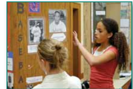
Students setting up exhibits for Wyoming History Day.

Officially established in 1945, the American Heritage Center (AHC) is the University of Wyoming's (UW) repository of manuscript and special collections, rare books, and the UW Archives. We are widely acknowledged by the University community, by the people of Wyoming, and by scholars world-wide as one of the nation's finest special collections repositories.