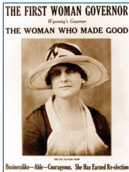
Reelection campaign poster for the first woman governor in the United States, Wyoming Governor Nellie Tayloe Ross, 1926. Nellie Tayloe Ross Papers.