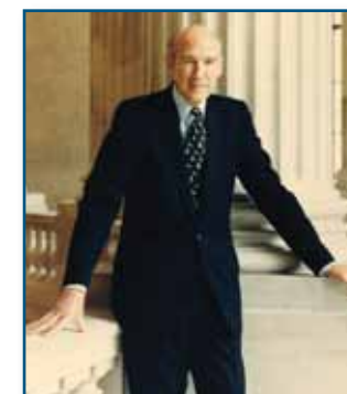
Wyoming U.S. Senator Alan K. Simpson (Ret.)

Since its beginnings in 2000, the Alan K. Simpson Institute for Western Politics and Leadership has acquired the personal papers, organizational records and oral histories of individuals and organizations prominent in political and economic leadership in the West. The Institute is a dynamic program of the University of Wyoming's American Heritage Center that seeks to document political, economic and other aspects of leadership in the West, particularly the Rocky Mountain West. Promotion of innovative, interdisciplinary research by students, faculty and scholars on the unique characteristics of Western leadership is key to the Institute's vision. Public programs offered by the Institute advance dialog on leadership issues affecting the politics and economy of the West.