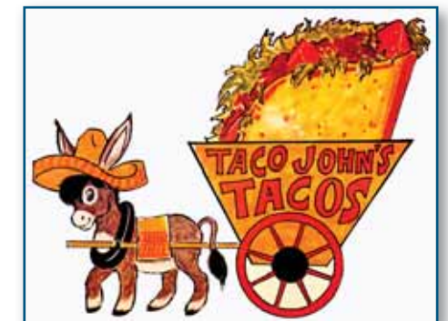
An early logo used by Taco John's International, Inc., 1976-1979. Taco John's International, Inc. Records.